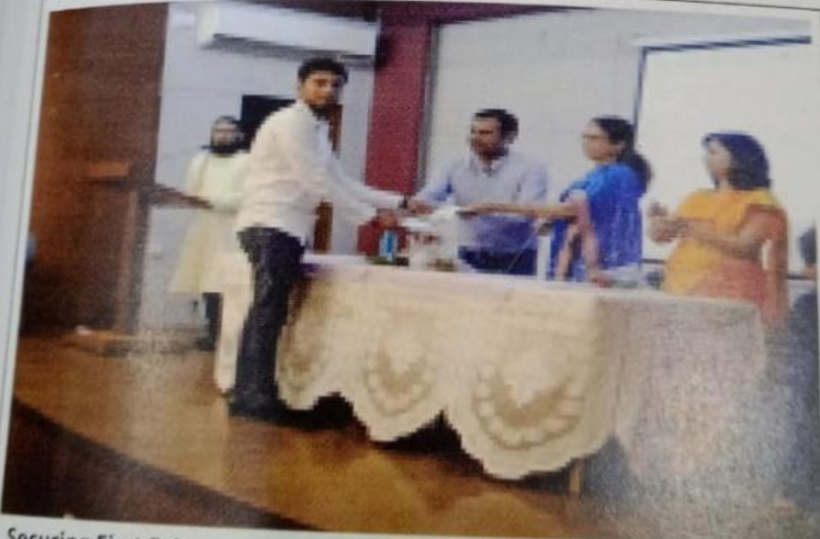
Securing First Prize in Calligraphy Competition from Urdu Department