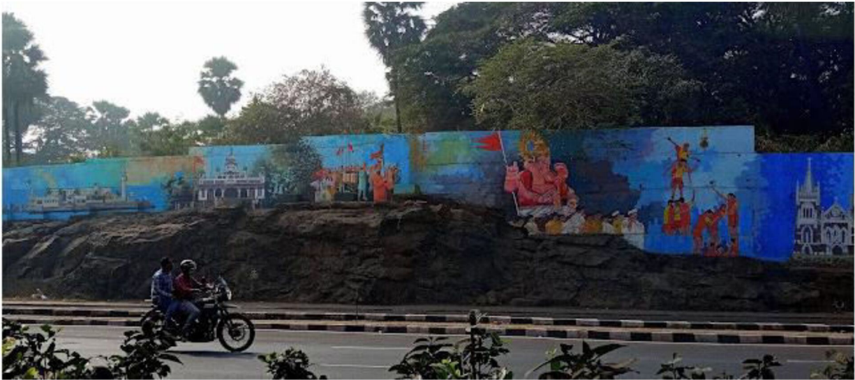
Murals: Bringing a smile to commuters' faces ....