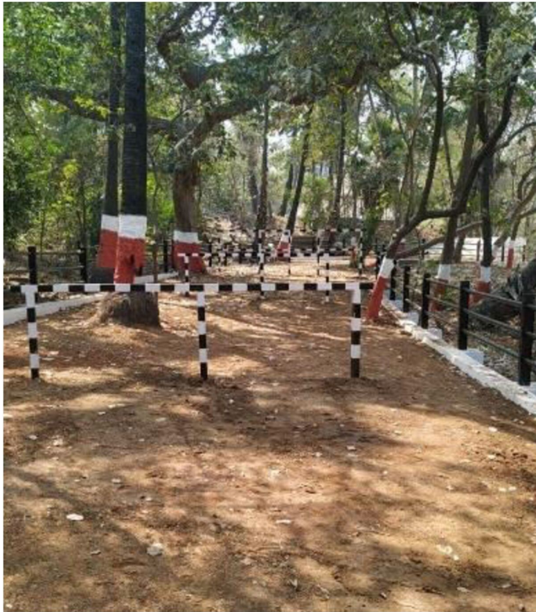
Right-Hand Wall & Left-Hand Wall