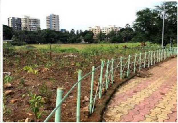
22 nd August 2019