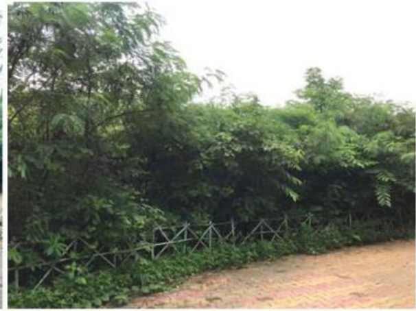
22 nd August 2021

Photographs visually demonstrate the project's success and impact.