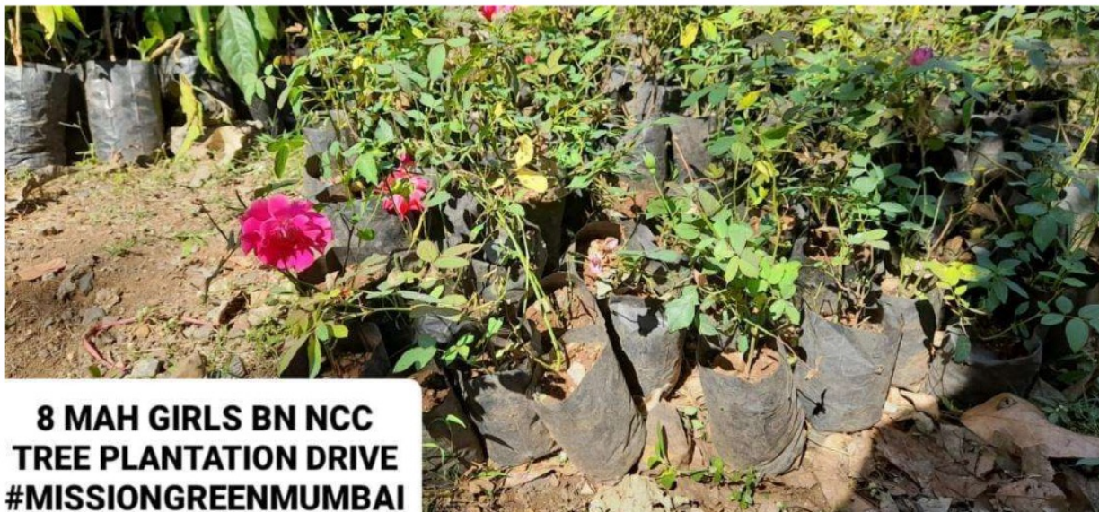
8 MAH GIRLS BN NCC TREE PLANTATION DRIVE #MISSIONGREENMUMBAI