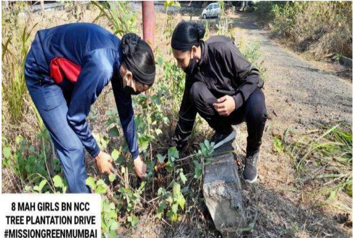
8 MAH GIRLS BN NCC TREE PLANTATION DRIVE #MISSIONGREENMUMBAI