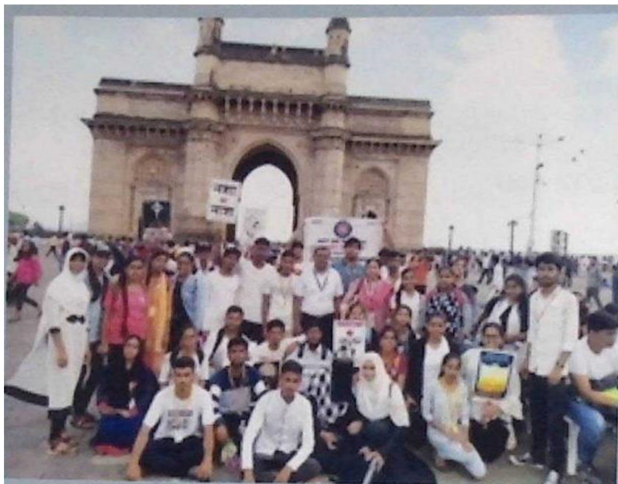
Drive against drugs