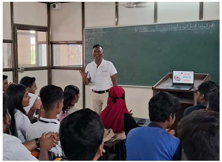
Seminar – Formula for a Successful Career (Date: 12 Jan. 2024)