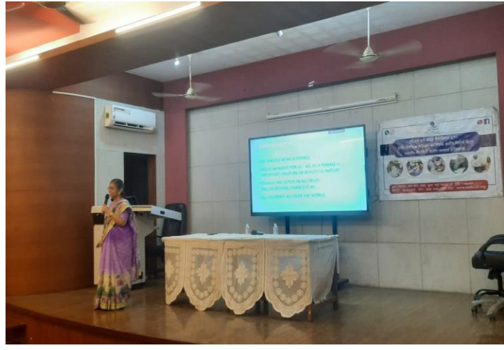
Health Awareness Talk – Problems in Puberty & Adolescence in Females (Date: 09 March 2024)