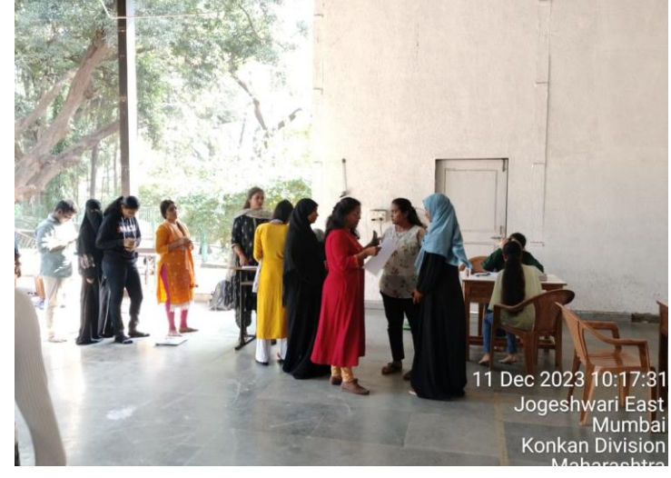
Health Medical Checkup (Date: 11 Dec. 2023)