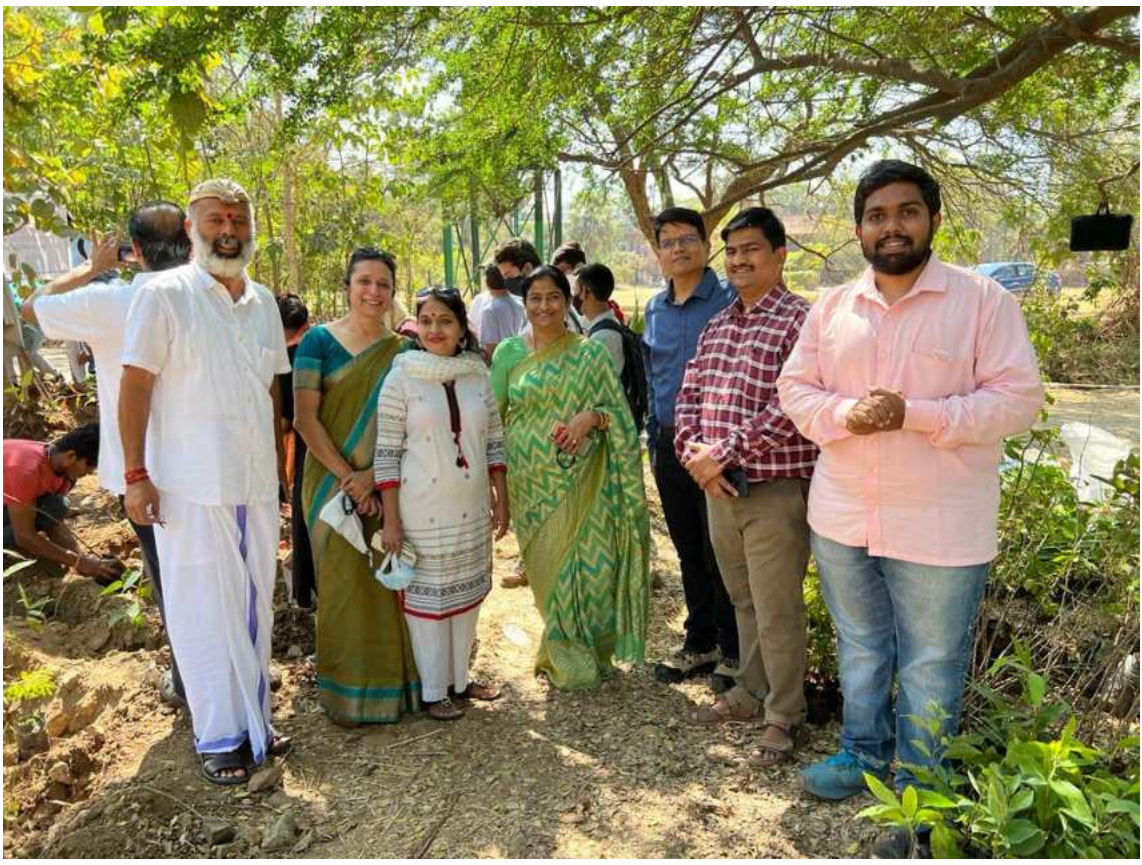
16th & 17th February 2022