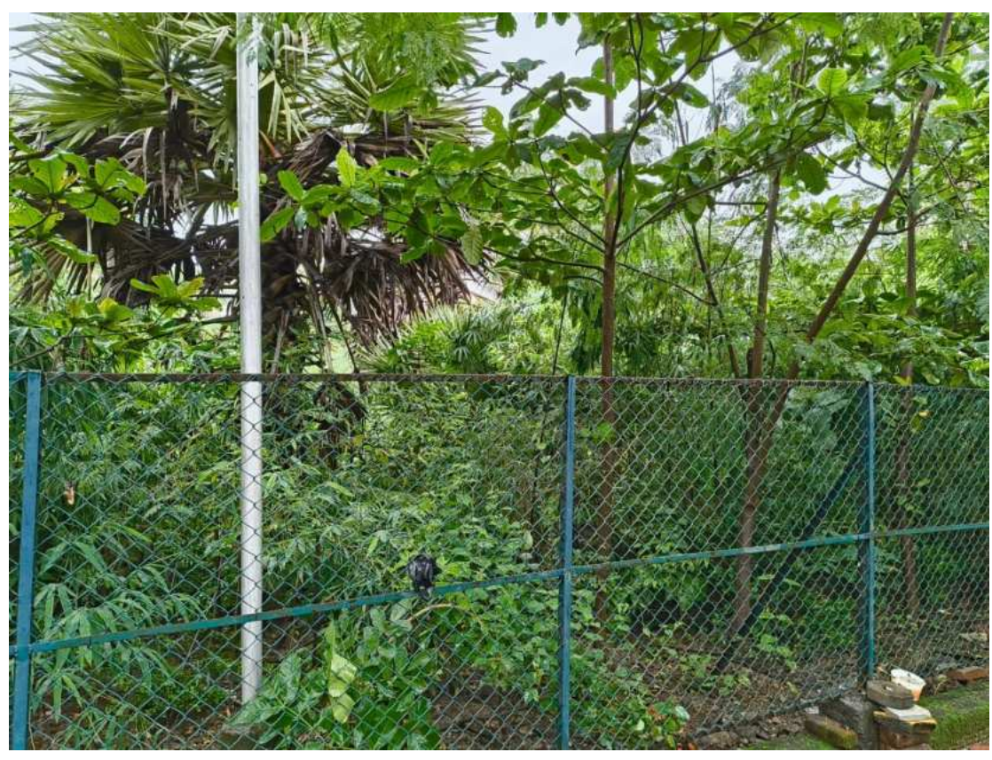
3rd August 2024