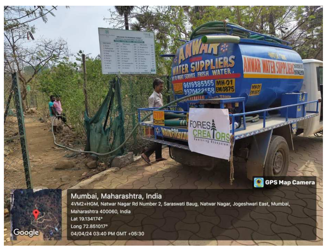
4th April 2024 (Water tankers were used daily during the dry period)