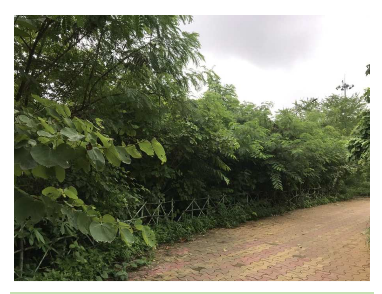
22^{nd} August 2021

The First Miyawaki Urban Dense Forest was a huge success with high survival rate and luxuriant growth of plants resulting in a dense wall of vegetation. It served as an ideal example of Miyawaki Forest and laid the foundation of other similar project in the College.