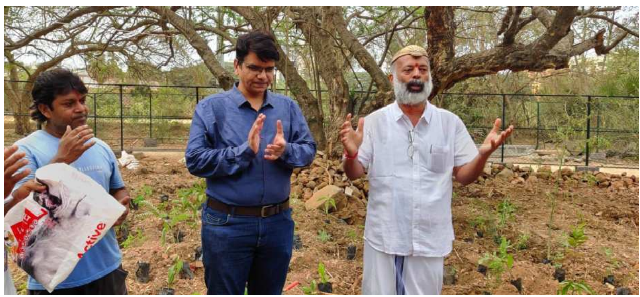
5<sup>th</sup> June 2022: Plantation begins.....