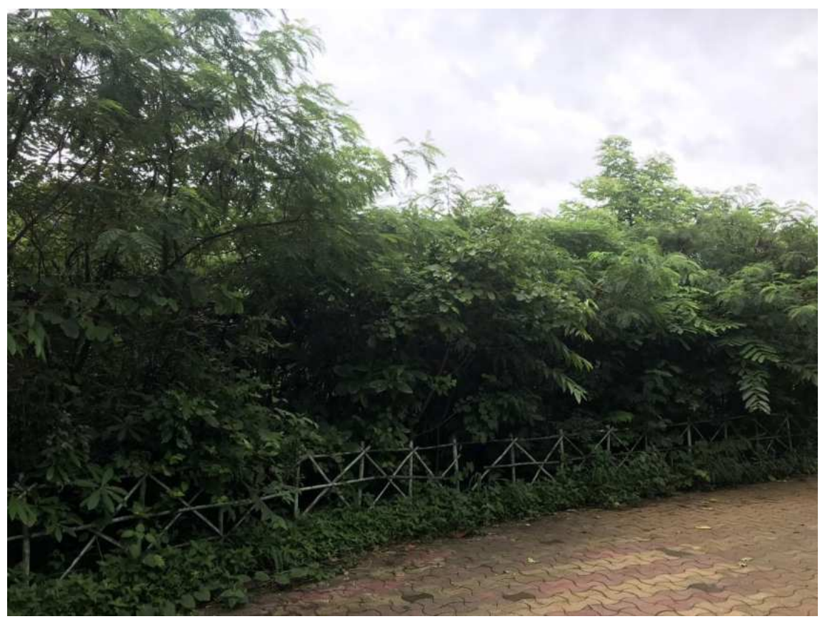
22<sup>nd</sup> August 2021