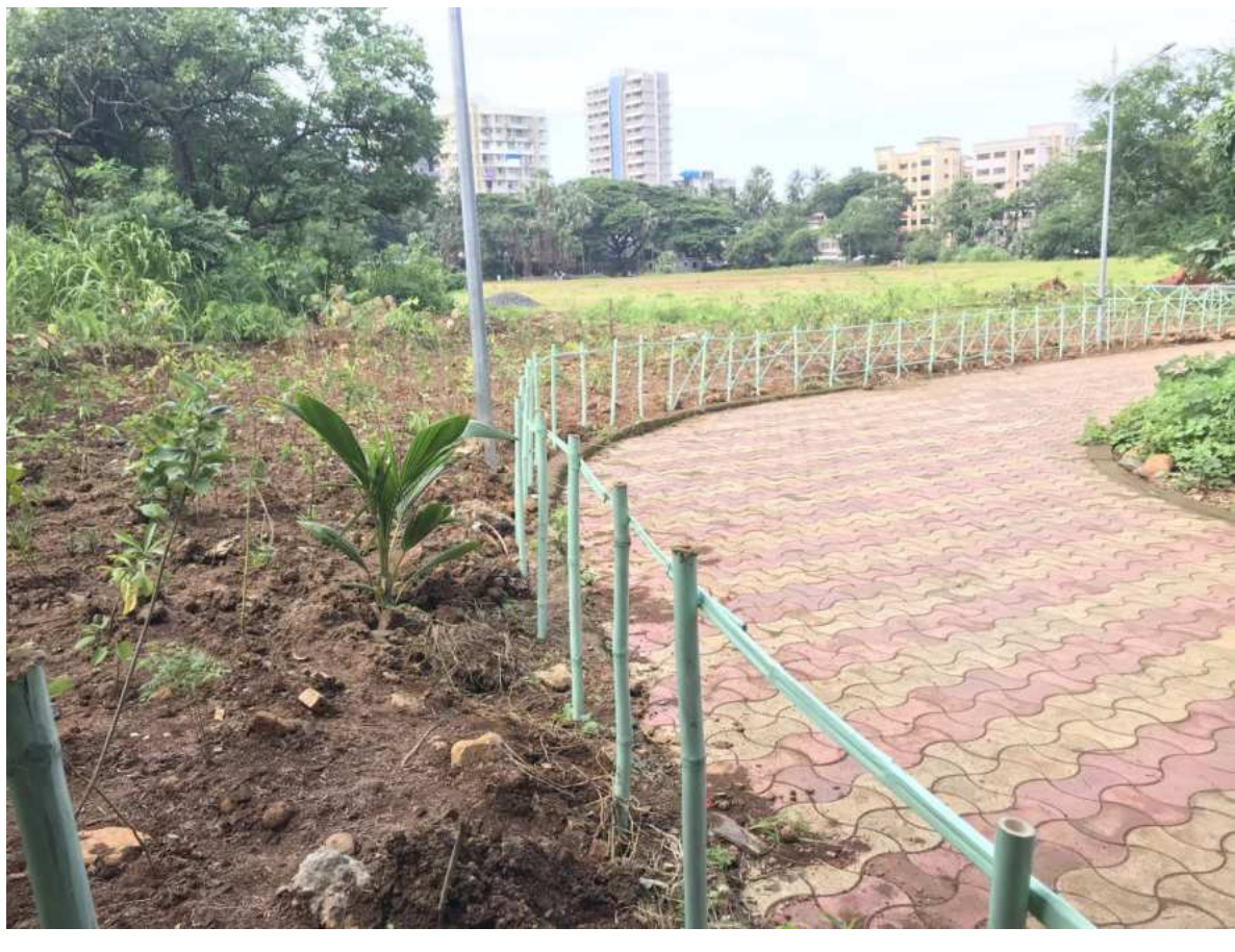
22<sup>nd</sup> August 2019