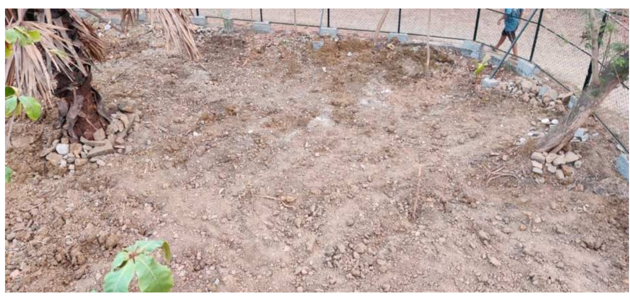
Preparation of land for Miyawaki plantation.