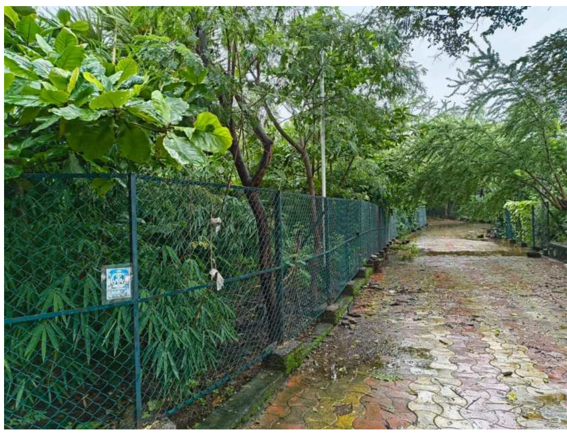
3rd August 2024